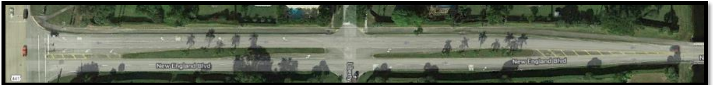
ABOVE: 2 New England medians are getting curbs; RIGHT: Kimberly's western-most median also getting a curb

Items include clothes, notebooks, backpacks and shoes. There will be cost limits on certain items.